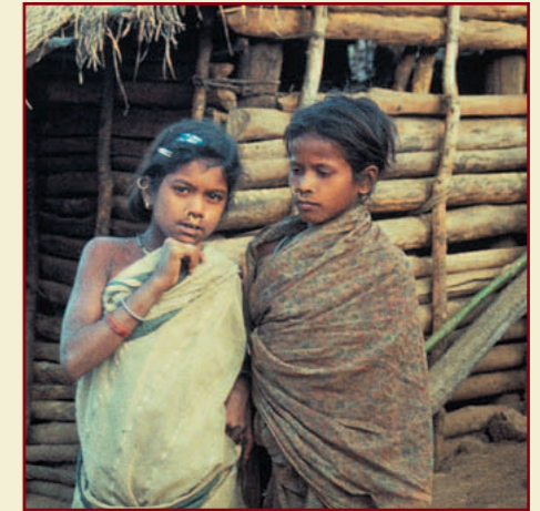
Risk factor poverty: Children who fight for their survival are an easy prey for traffickers luring them with promises of a better life.

Hence the campaign makes the following demands: