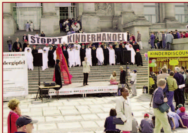
Together against child trafficking: Public event in front of the Reichstag in Berlin.

The International Campaign needs people who identify with its aims and who use their influence to put child trafficking on the political agenda. To meet the challenges of the campaign additional financial help is also necessary. This support contributes to a better protection of children from traffickers and offers the victims better living prospects.